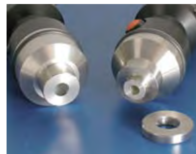
Two types of scan head are available: 1" diameter footprint or 5/8" diameter with a snap-on 1-3/8" base.

AMETEK ® MEASUREMENT & CALIBRATION TECHNOLOGIES