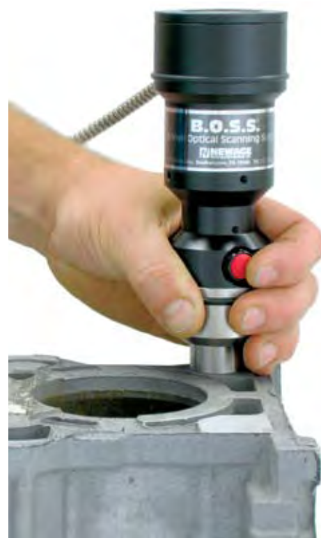
The click of a button instantly captures an image of the test impression. This captured image is then used in measuring so operators don't have to hold the scan head still longer than an instant.

You also have the ability to add "comments" to further define the test setup file.