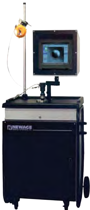
The optional mobile enclosure helps keep your B.O.S.S. system clean of environmental contaminants and provides a firm work area- whether in the lab or production area.

It is well known that measuring Brinell impressions can result in measurement errors of 0.1 mm between operators - the range is even greater between labs. This error can take up your entire tolerance specification. The B.O.S.S. will virtually eliminate operator influence on test results. Gage R&R evaluations show dramatically improved repeatability. With the B.O.S.S. your test results won't change with every shift change.