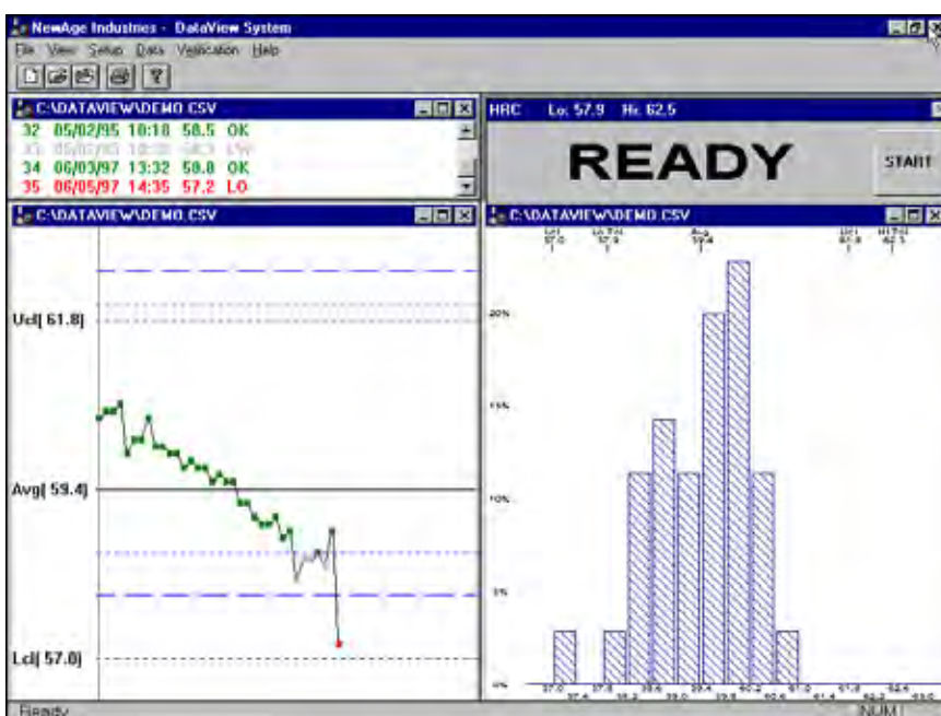
Shown: With the optional DATAVIEW software, users have a variety of analysis and data management tools available.