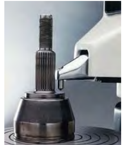
Shown: The indenter assembly design provides excellent visibility over the testing area.

The INDENTRON indenter makes it ideal for testing inside diameters. Using the standard indenter, inside diameters as small as 1-1/2" can be tested. An optional indenter and shortened indenter can test inside diameters as small as 1/2". The operator may also test close to vertical surfaces to within 1/4" with the standard indenter or 3/32" with a special indenter. The indenter design also provides the operator with an excellent view of the testing location.