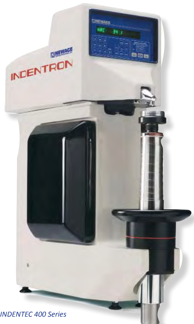
Shown: INDENTEC 400 Series